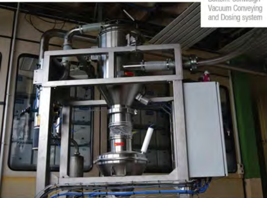
Bottom: Conweigh Vacuum Conveying and Dosing system

located material storage area, was the solution. A twin arrangement of the bulk bag unloaders, capable of quickly switching from one bulk bag supply to the other, was developed to maintain a consistent supply of the resin granulate to the mixers, without losing time for bag changeover.