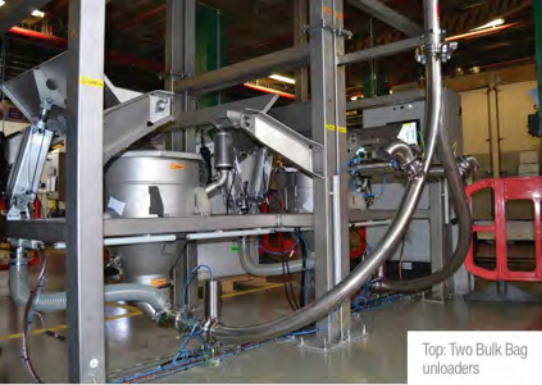
Top: Two Bulk Bag unloaders